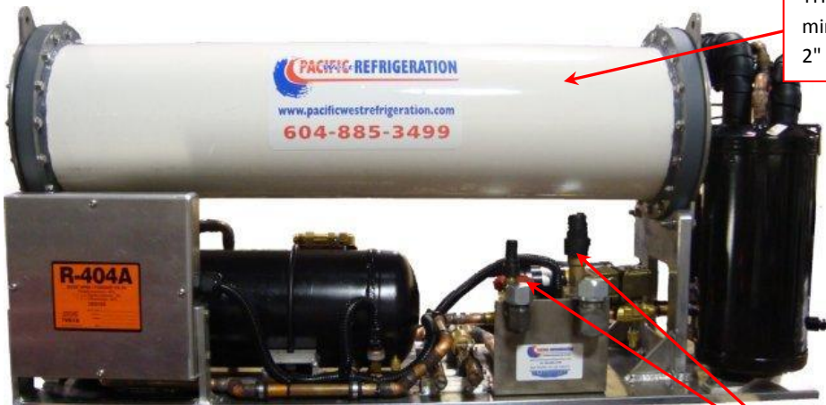
CHILL PACK - DRY WEIGHT ~300lbs APPROX. DIMENSIONS:42.5"L x 13"D x 20.5"H