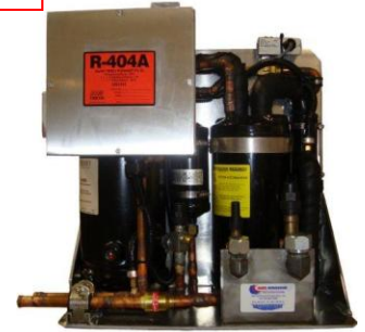
SMALL SPLIT PACK -REMOTE MOUNT CHILLER -KEEL OR TRANSOM COOLED